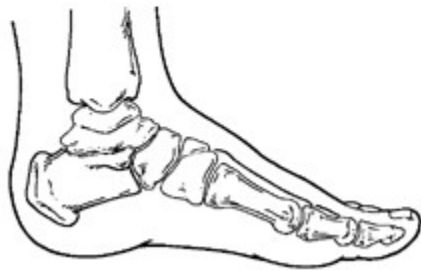
Normal pediatric foot